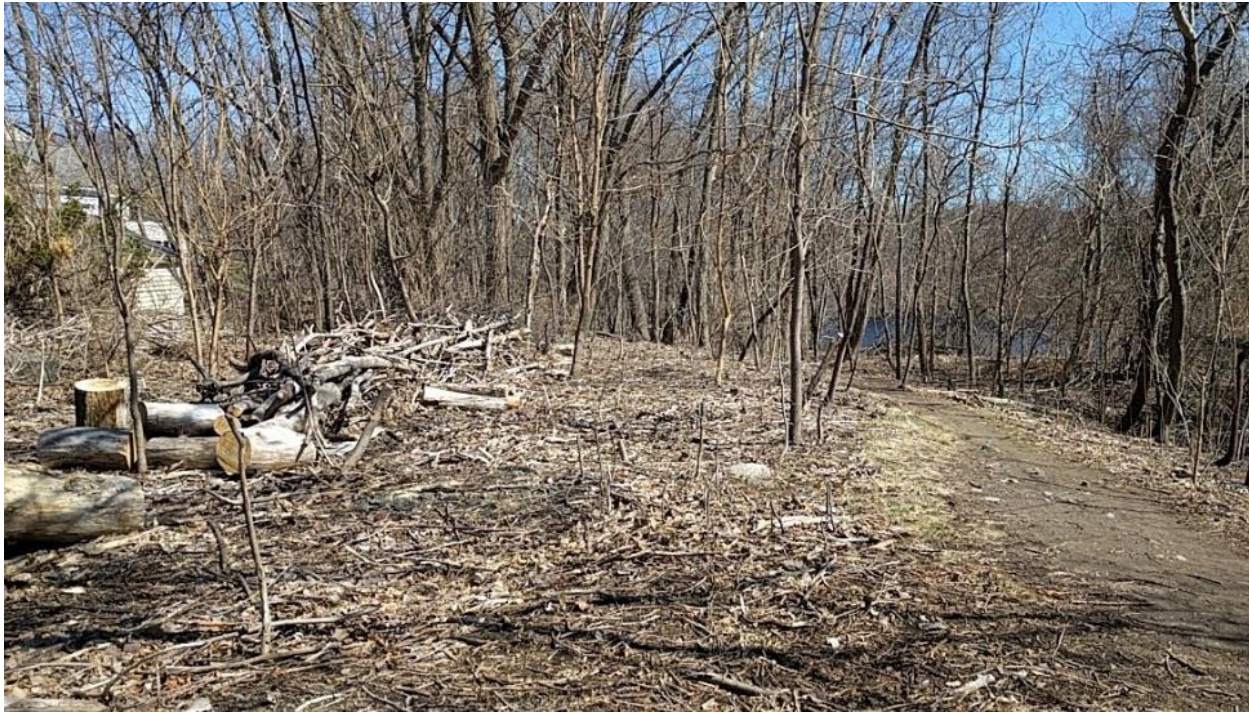
There are already signs of last year's perennial plantings returning along the brook, including Great Blue Lobelia, Bee Balm, Blue Flag Iris, Phlox, and Marsh Marigold. There